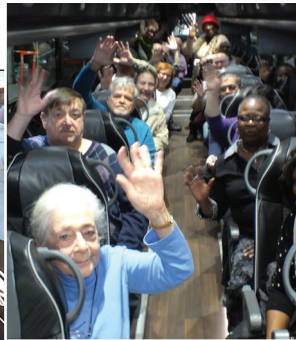
▲ The bus ride to Washington, DC, for the Friedrichs rally.