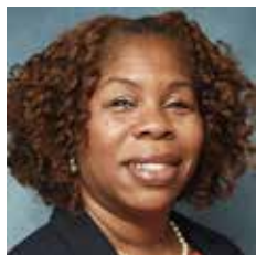
Karen Alford Elementary Schools