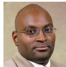
Sterling Roberson Career & Tech HS