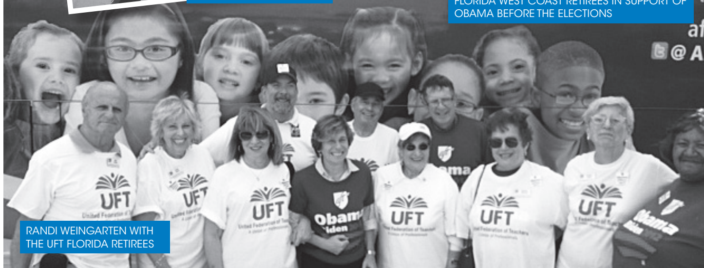
RANDI WEINGARTEN WITH THE UFT FLORIDA RETIREES