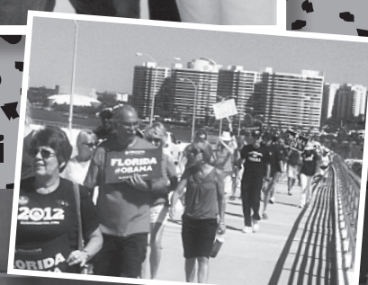
FLORIDA WEST COAST RETIREES IN SUPPORT OF OBAMA BEFORE THE ELECTIONS