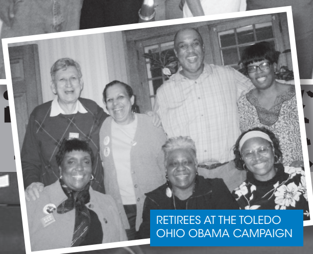
RETIRES AT THE TOLEDO OHIO OBAMA CAMPAIGN