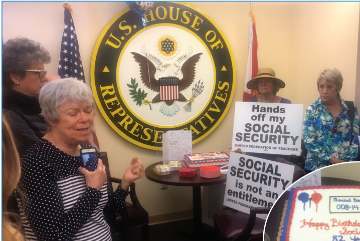
With UFT support, Florida ARA members had a birthday celebration for Social Security at Congressman Vern Buchanan's office.